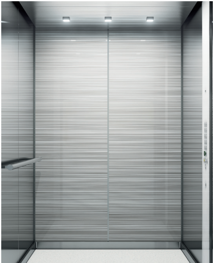
A stylish car interior, with award-winning KONE Design signalization, is an attractive feature in any building.